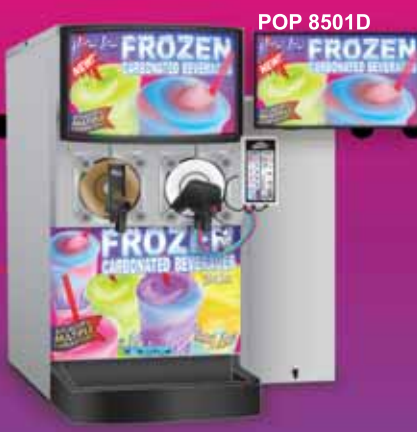
Taylor® C300 & FB 80FCB AUTO POP 8515 & POP 8501D