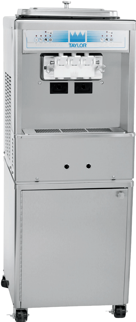
Photo shows Model 161 with optional cart

Protects the operator from injury as the beater will not operate without the dispensing door in place.